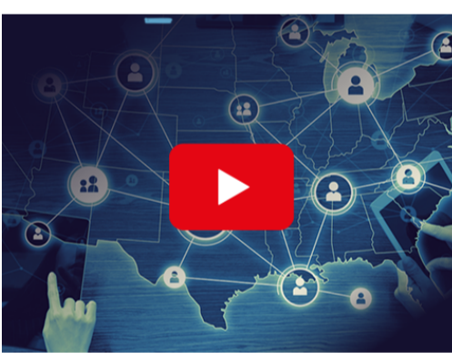
Scholars' Hub @ Home: Media and the Democratic Crisis in North America

Missed our latest Scholars' Hub or Level Up session? Catch up at our YouTube channel and explore various topics and key insights from the York community.