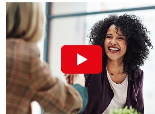
Level Up | Landing the Job: Insider tips from recruiters