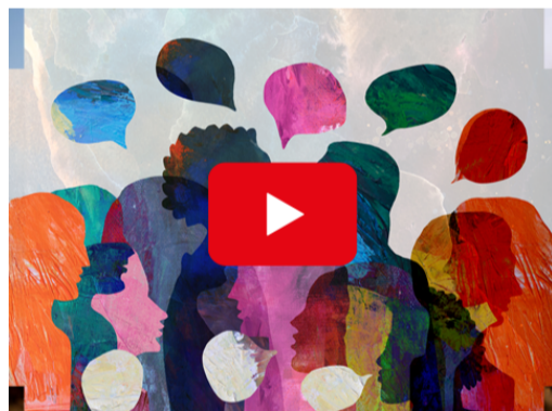
Scholars' Hub @ Home | Buried Histories: Racial geographies of memory from New York to Toronto

Missed our latest Scholars' Hub or Level Up session? Catch up at our YouTube channel and explore various topics and key insights from the York community.