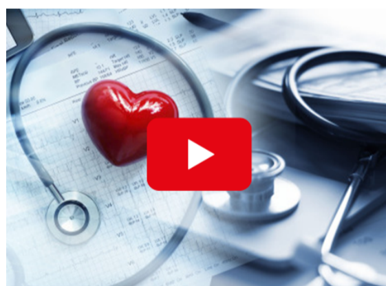
Scholars' Hub @ Home | Genomics, Artificial Intelligence and Personalized Healthcare: The Canadian story

Missed our latest Scholars' Hub or Mid-Career Conversations session? Catch up at our YouTube channel and explore various topics and key insights from the York community.