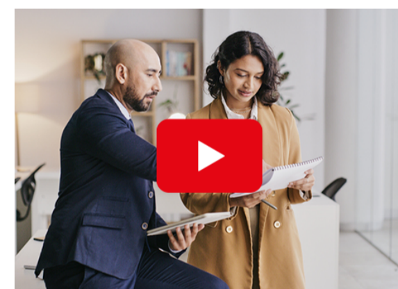
Mid-Career Conversations | Let's Talk Numbers: Salary negotiation with confidence and clarity