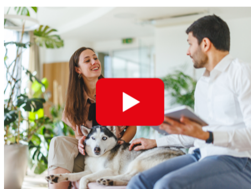
Scholars' Hub @ Home | Human-Animal Attachments in the Workplace: The rise and future of pet-friendly organizations

Missed our latest Scholars' Hub or Level Up session? Catch up at our YouTube channel and explore various topics and key insights from the York community.